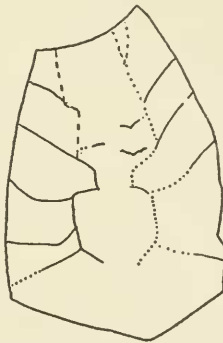
Fig. 2. Outline of Archegonaspis? sp., showing reconstruction of canal system from the grooves of the inner surface. Visible portions are indicated in solid lines; indistinct portions by broken lines, frankly inferred connections by dotted lines, where no trace of the canal system could be seen.

Etching has revealed in addition to the normal features of the dentin and cancellous layers, a series of rather irregularly spaced short transverse canals which represent the lateral line system. Though more irregular and less complete, as series, than those shown for Poraspis (Kiaer and Heintz, 1935, fig. 3b, p. 45,) they are clearly analogous to the median portions of the ventral transverse commissures, and the lateral portions of the ventral transverse commissures, though only a very few individual canals of this last series can be detected, and it is not easy to distinguish them from the cracks in the ventral plate which are the result of slight flattening.